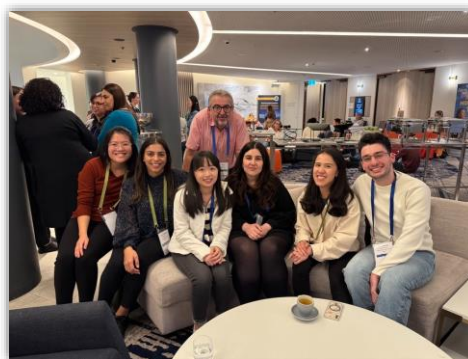
Left: Pharmacy Contingent at Medicines Management conference, Melbourne, November 2025 Right: COSA Cancer Pharmacist Groups Clinical Practice Course, Melbourne, May 2025