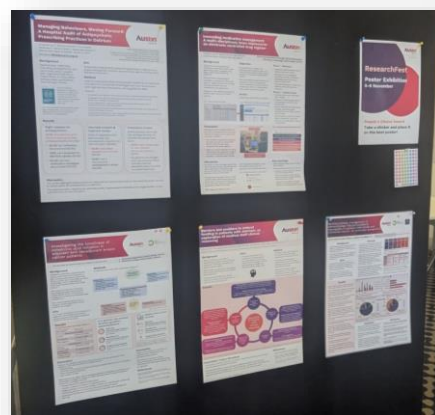
A selection of Research Week posters